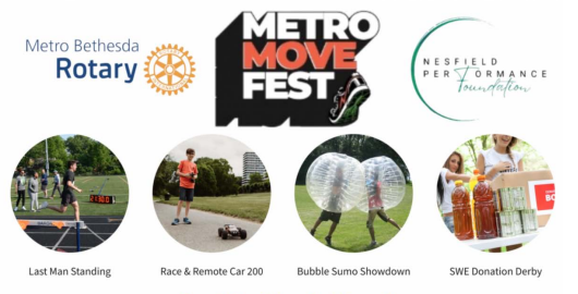
And So Much More!

Tickets: https://app.aplos.com/aws/events/metro_move_fest